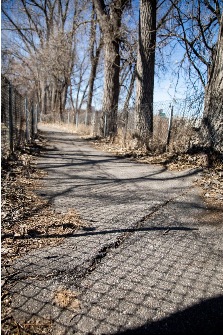
Pavement at end of useful life