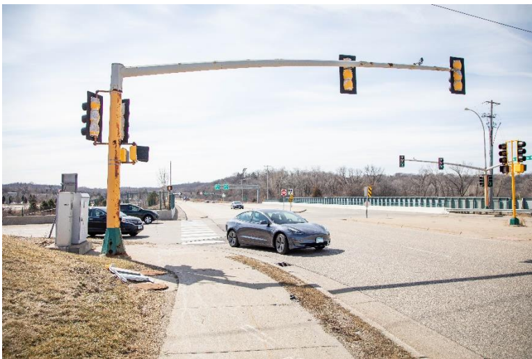
Challenging crossings and end-of-life concrete sidewalk along Bush Lake Road near I-494 ramps