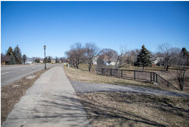
Concrete sidewalk at end of useful life along Noble Avenue