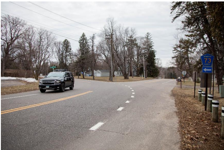
No bicycle or pedestrian infrastructure along County Road 73 near Highway 55