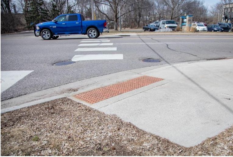
Non-ADA-compliant crossing at 6th Street