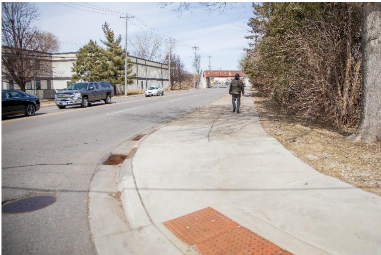
End-of-life concrete sidewalk along segment of the existing regional trail