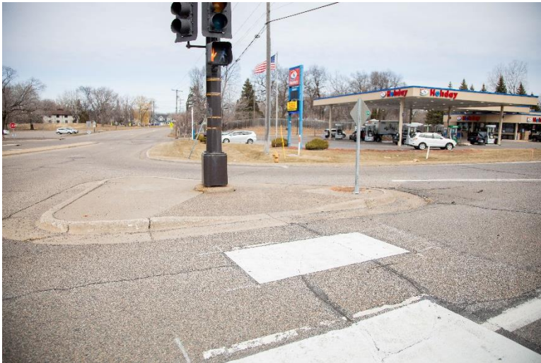
A crossing needing improvement along Highway 55