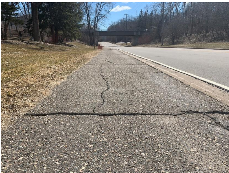
Close-up of poor conditions on Rowland Road