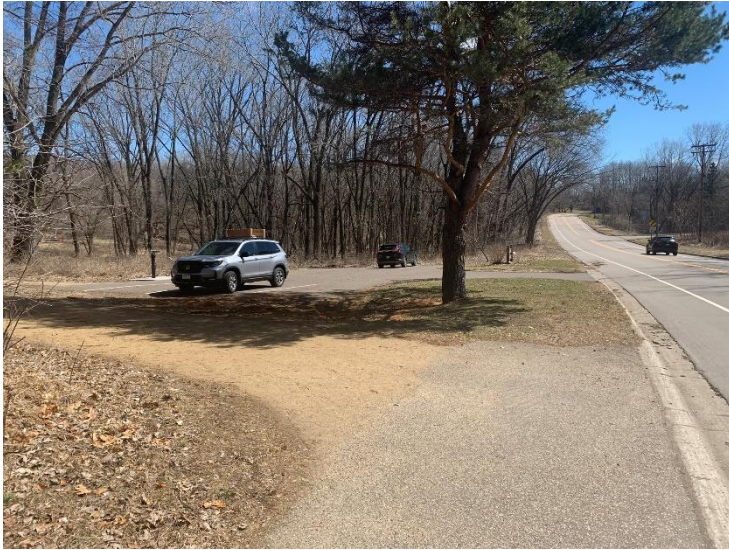
Sub-standard conditions at the connection with Lone Lake Park

Project components include 3.70 miles of new trail, 1.00 miles of improved trail, and 17 improved crossings