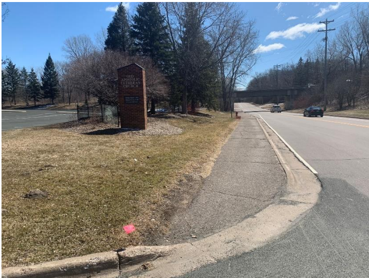
Sub-standard, narrow path on Rowland Road that is past its useful life