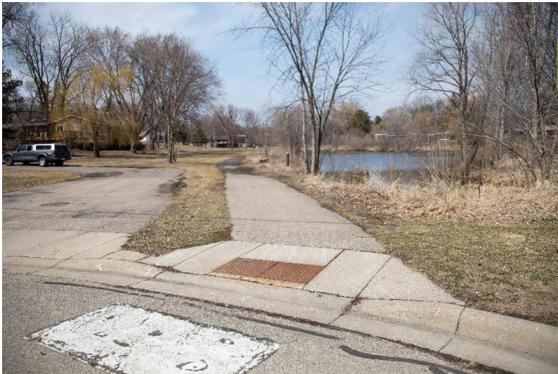
Non-ADA-compliant crossing at Westbend Road