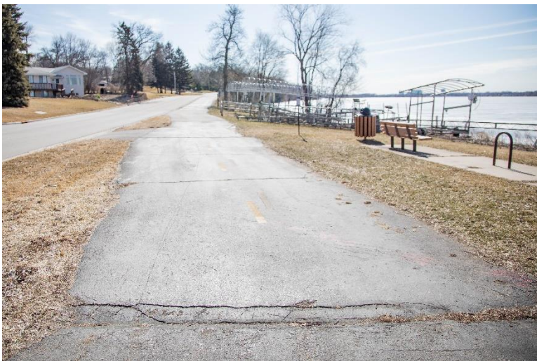
Poor pavement on the south end of Medicine Lake