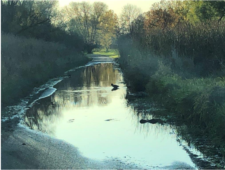
Flooded trail segment in Brooklyn Center

Project components include 1.84 miles of reconstructed regional trail and four improved crossing