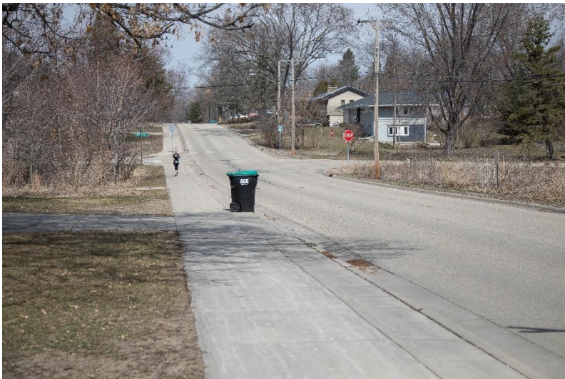
End-of-life concrete sidewalk on Regent Avenue that will be replaced with new regional trail