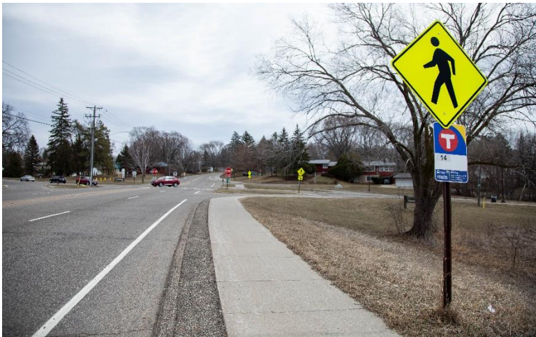
Approaching intersection of Golden Valley Road and Theodore Wirth Parkway – where new regional trail will be constructed to connect to the Minneapolis Grand Rounds network of regional trails and the vibrant but historically disadvantaged North Minneapolis communities