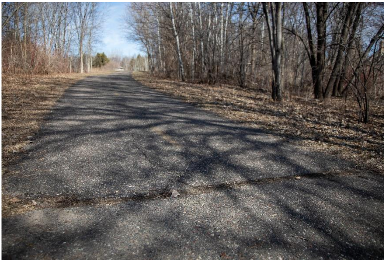
Large cracks on existing regional trail near Northwest Boulevard