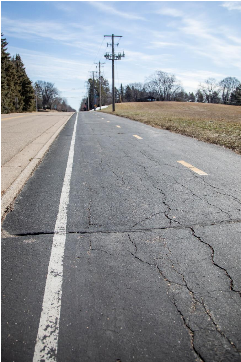
Pavement in poor condition along 36th Avenue