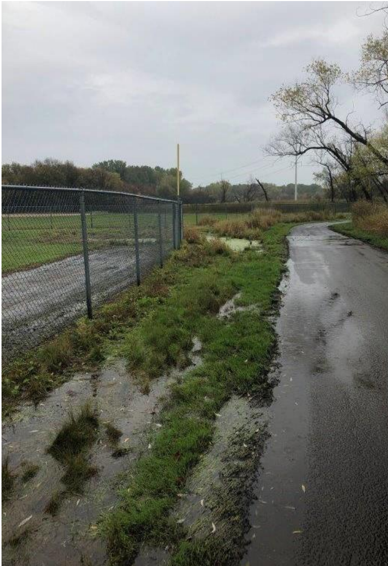
Flooded trail segment near Palmer Lake Park