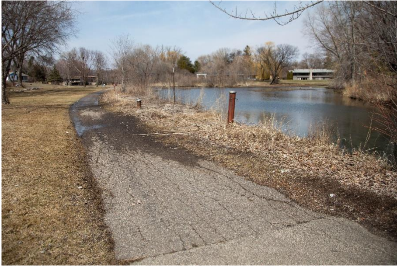
Segment of existing regional trail that is past its useful life and where frequent flooding occurs

Project components include 0.25 miles of new trail, 0.70 miles of reconstructed trail, and three improved crossings