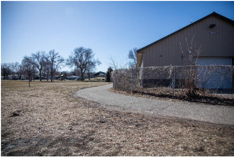
Section of trail needing realignment to address safety issues caused by the current 90-degree turn