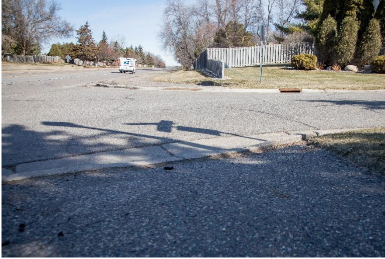
Non-ADA-compliant crossing at 44th Avenue