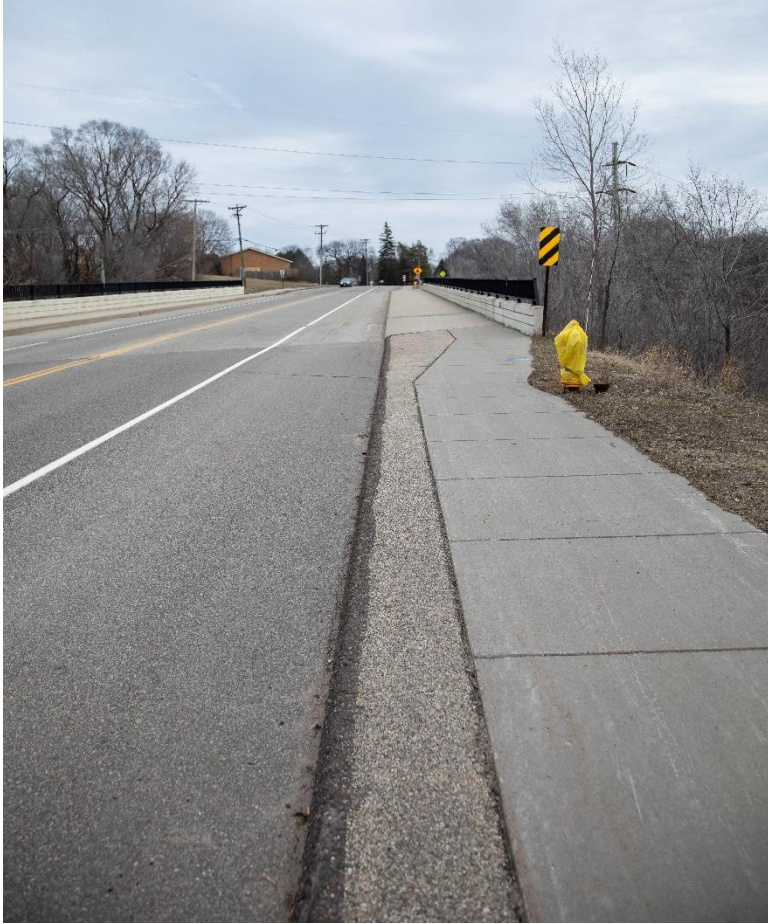
South side of Golden Valley Road over railroad tracks between Bonnie Lane and Theodore Wirth Parkway – where safe, comfortable, new regional trail will be constructed