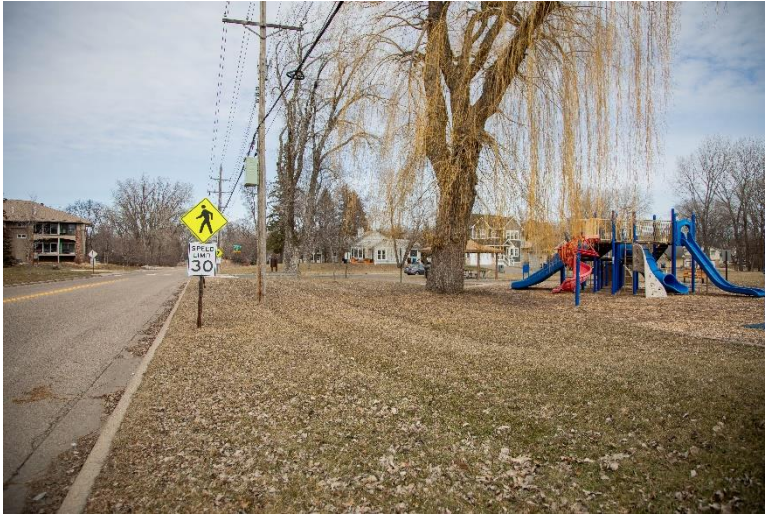
Playground along South Shore Drive just south of the Luce Line Regional Trail – the roadway currently has no bicycle or pedestrian infrastructure

Project components include 1.50 miles of new trail, 1.50 miles of reconstructed trail, 2.2 miles of improved trail, and nine improved crossings