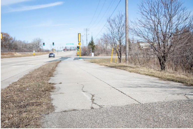
End-of-life concrete sidewalk along Bush Lake Road near W 84th Street