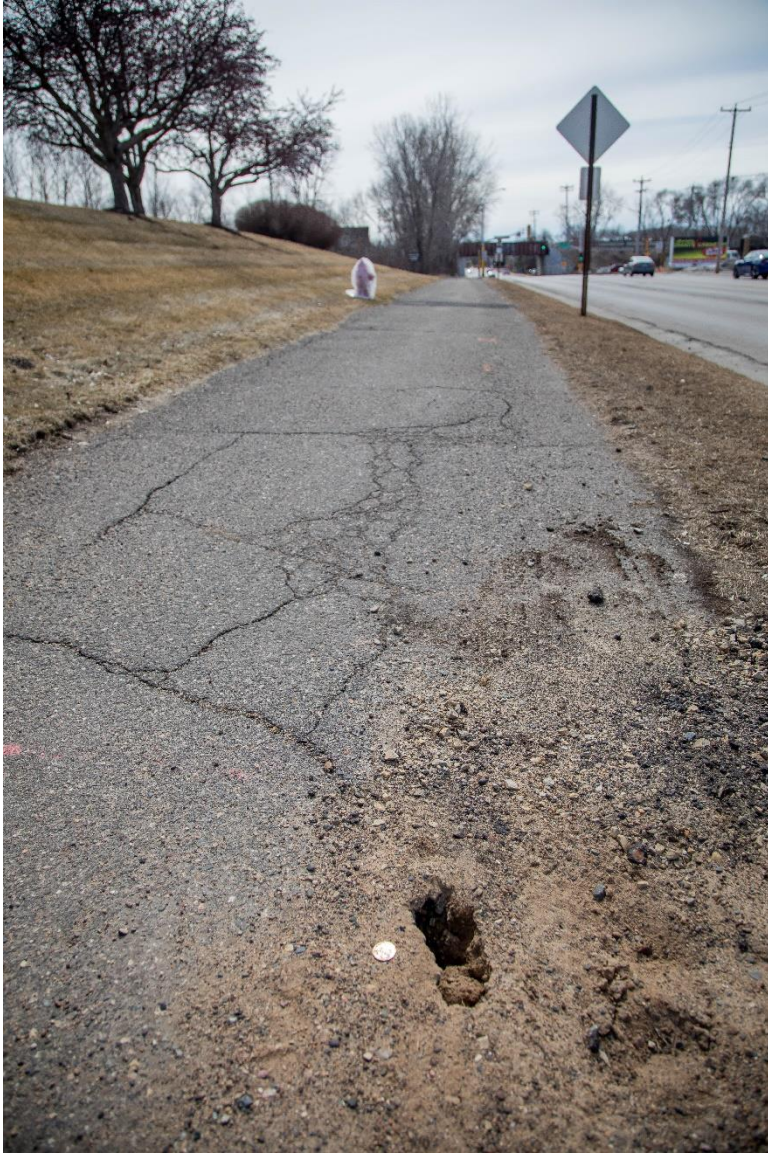
Failing pavement along segment of the existing regional trail