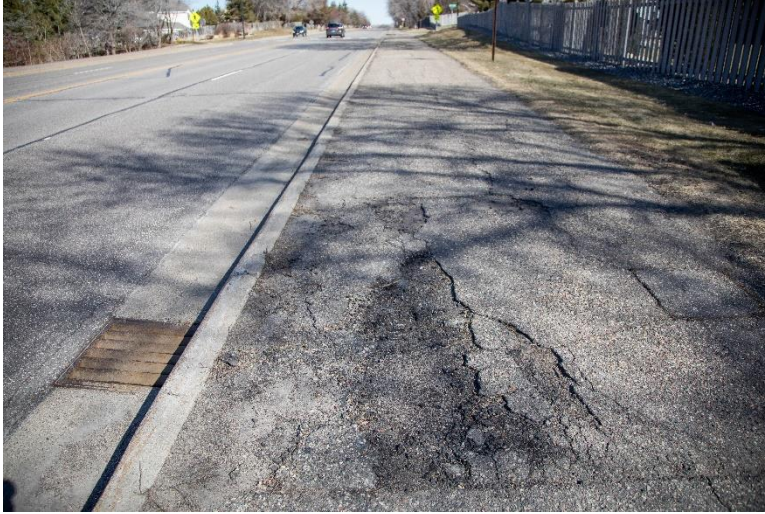
Failing pavement along Northwest Boulevard

Project components include 3.75 miles of reconstructed regional trail and six improved crossings