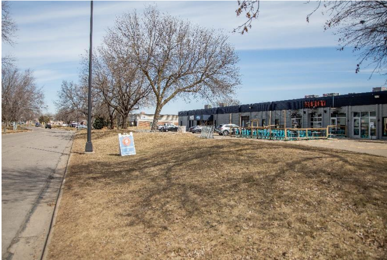
Along Bush Lake Road near W 74th Street and Wooden Hill Brewing Company, where new trail would be constructed

Project components include 1.75 miles of new trail, 5.25 miles of improved trail, and 10 improved crossings