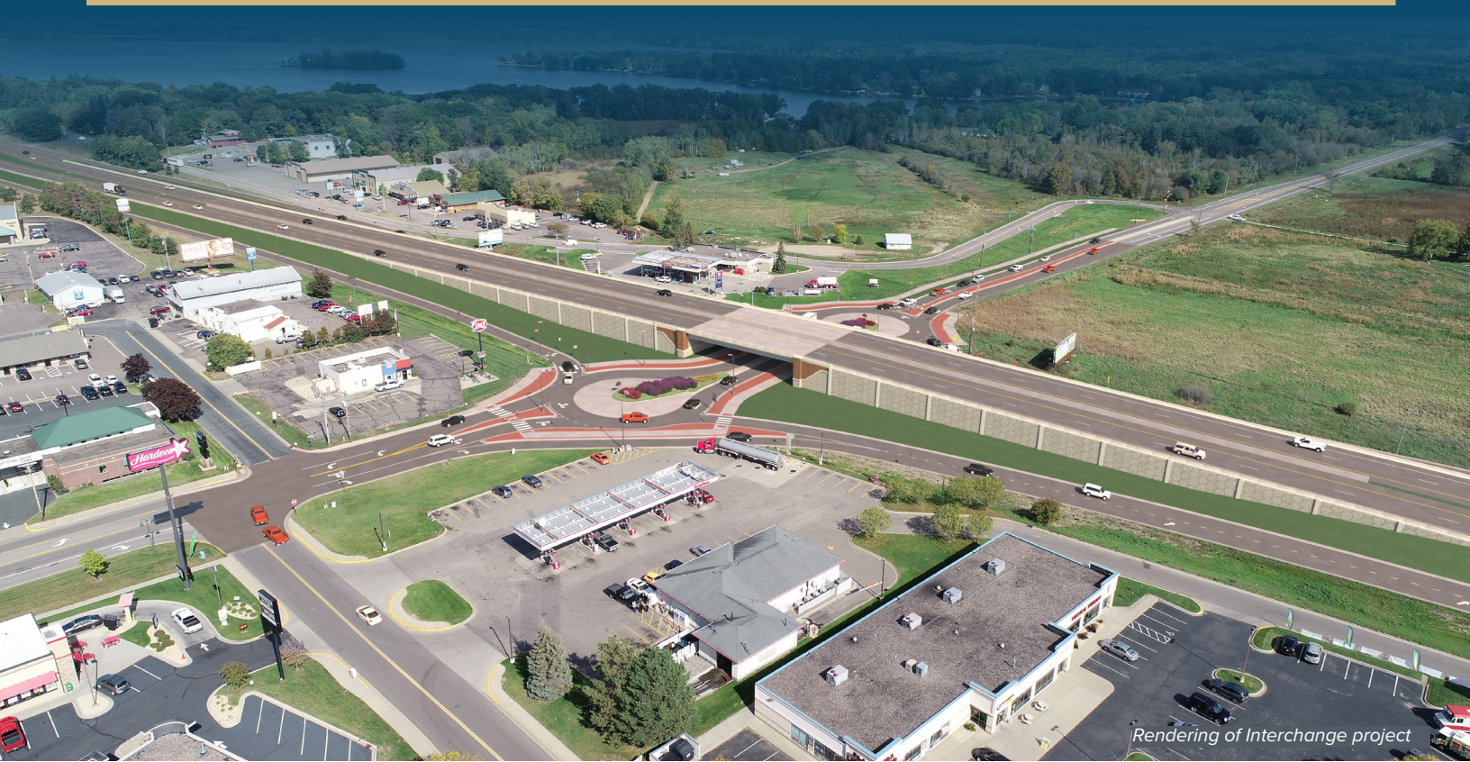
Rendering of Interchange project

FY 2023 Rebuilding American Infrastructure with Sustainability and Equity (RAISE) Program