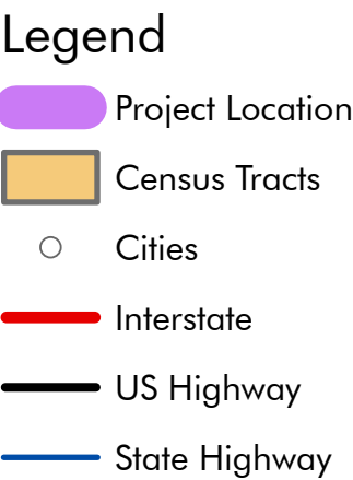
Figure X. Project Corridor Census Geographies