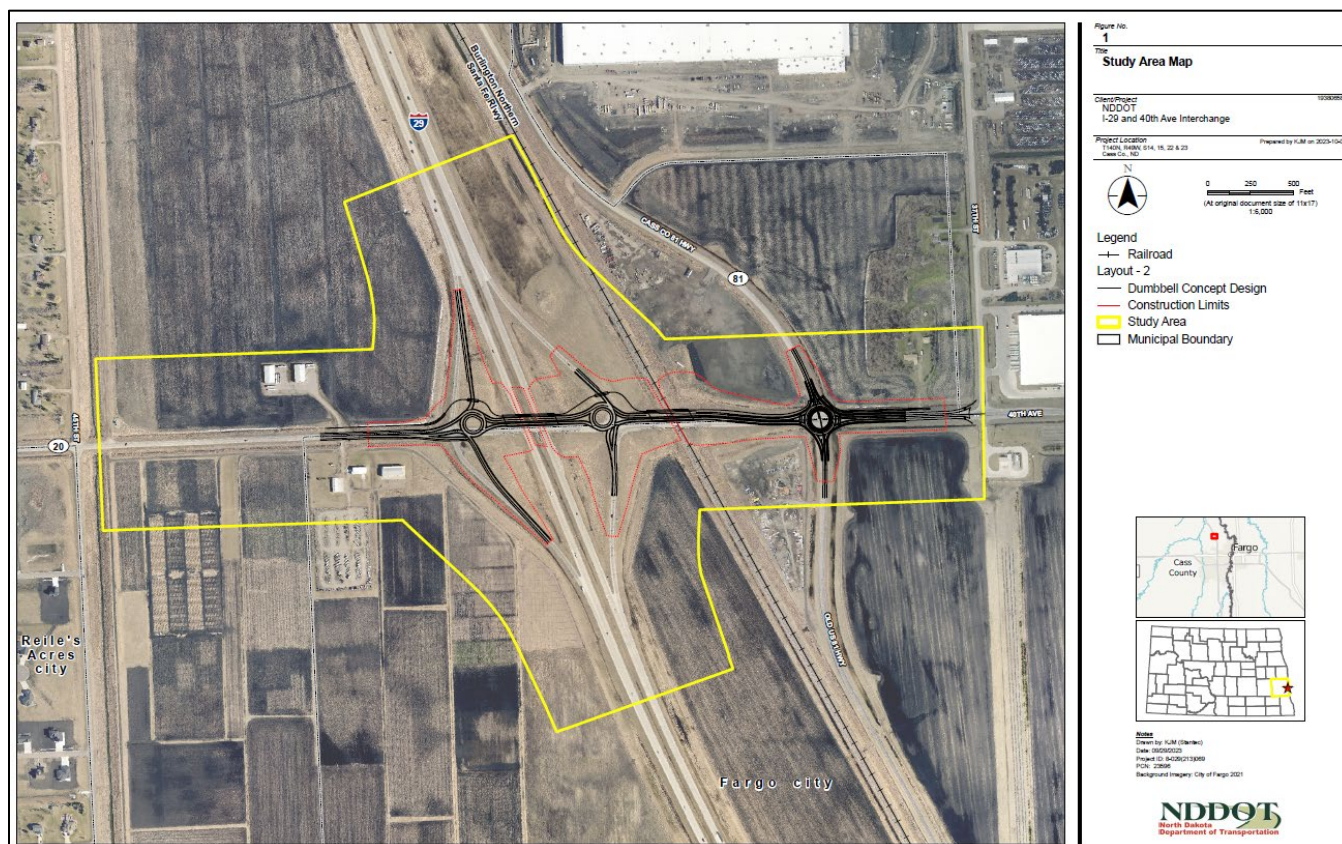
Figure 1 - Project Location Map: I-29 and 40 th Avenue North Interchange